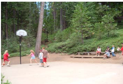
Camp Recreation Area

Proceeds from Camp rentals benefit the IOOF Camp Youth Programs, and help maintain the Camp. The Three Links stand for "Friendship, Love and Truth".