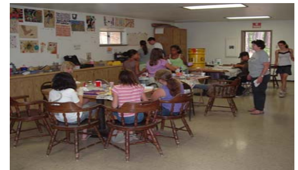
Camp Craft Building

Go North on US 99 to Merced. Take "G" Street to the East end of Snelling. Take County Road J-59 to CA 108. Turn right to Jamestown, then continue on CA 108 another 20 miles. Look for the Camp's white sign on the right side of the road as soon as you see the sign for Lyons Dam Road, past Mi-Wuk Village about 2-3 miles. Turn half right and follow the gravel road ½ mile to the Camp.