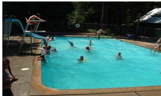
Camp Swimming Pool

If nothing else, stay and enjoy what the Camp has to offer as you make your own fun!