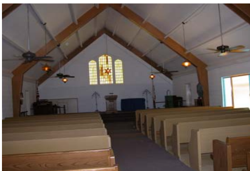
Inside the Chapel in the Pines