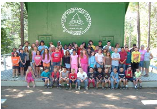
"Palladium" Amphitheater Stage