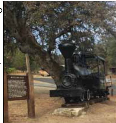
Photos show logging truck after impact and Whistling Billy after being put back on foundation.